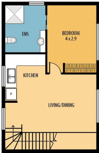
UPPER LEVEL (CABIN)