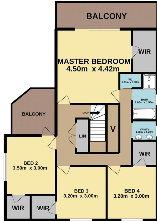
1ST FLOOR 82.8 sq.m. approx.