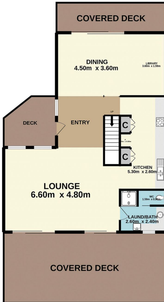
GROUND FLOOR 125.7 sq.m. approx.