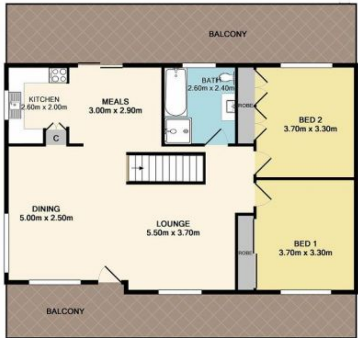
1ST FLOOR APPROX. FLOOR AREA 89.1 SQ.M. (959 SQ.FT.)