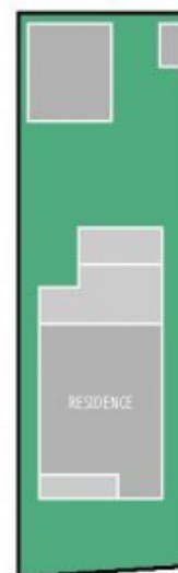
LAKE VIEW PDE