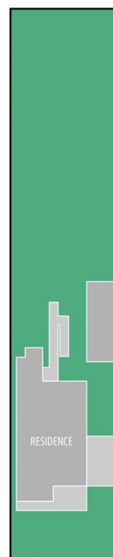
BRICK WHARF RD