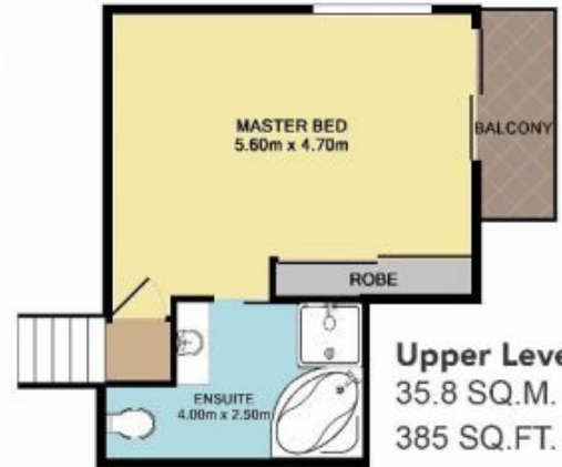
Upper Level 35.8 SQ.M. 385 SQ.FT.