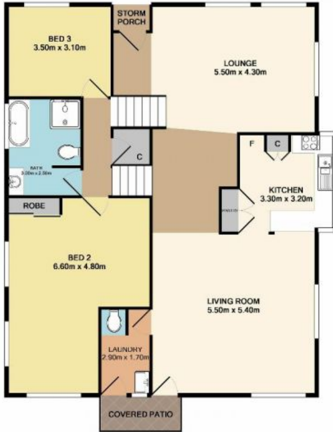
Entry Level 176.4 SQ.M. 1899 SQ.FT.